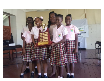
Cayon Primary School won the coveted Primary School Quiz Trophy