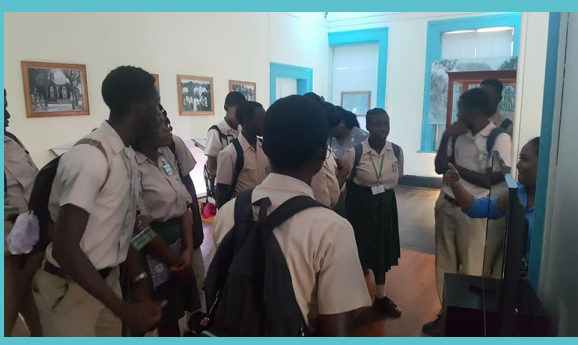
Cayon High School