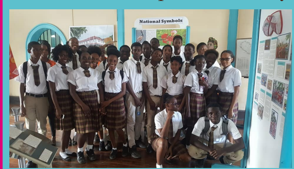
Washington Archibald High School