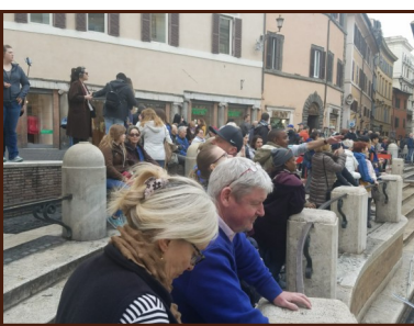
Members from the Course mingled with visitors at the Trevi Fountain

The workshops included visits to heritage sites and university laboratories where research and analysis of is conducted to continually improve methods of conservation.