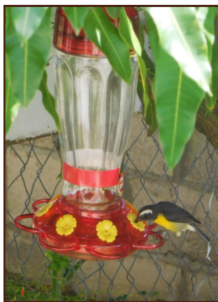
A Bananaquit using the hummingbird feeder

The National Trust still has hummingbird feeders available to give to interested persons.