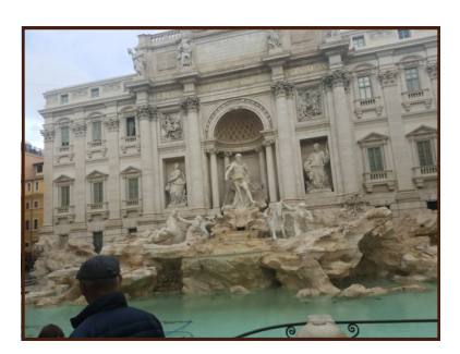
The course included field trips to historic sites like Rome's Fontana Di Trevi

The St. Christopher National Trust enhanced its resource capacity with the training of three of its key personnel in understanding the challenges of the conservation of structures.