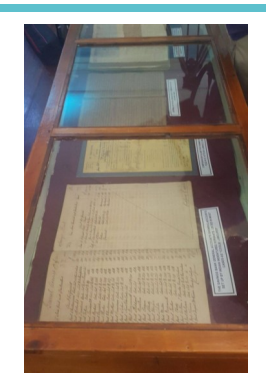
The Trust mounted the "Emancipation Journey" Exhibition at the National Museum