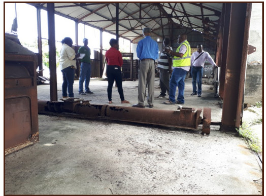
Trust officials visit the Spooner's site along with contractors and a Quantity Surveyor

Estate functioned as one of several regional mills on St. Kitts.